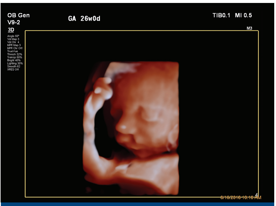
Figure 2 V9-2 transducer 3D image of unilateral cleft lip.

The patient was enrolled in a clinical evaluation study of the Philips V9-2 PureWave volume transducer which was ongoing at the time of her consultation at our practice. Utilizing the Philips V9-2 PureWave volume transducer on the Philips EPIQ Elite ultrasound system, additional imaging was performed with particular focus on the fetal palatal anatomy. The FlexVue with Orthogonal View feature, designed to simplify the evaluation of a 3D volume, was utilized to assess the fetal cleft lip and to evaluate the fetal palate.