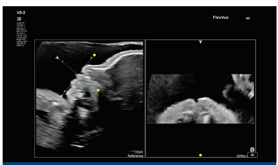
Figure 5 Orthogonal View line (Blue) demonstrating the corresponding transverse plane and fetal palate.